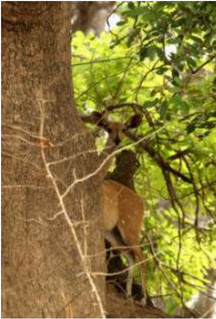
Bushbuck peeking out from behind a tree