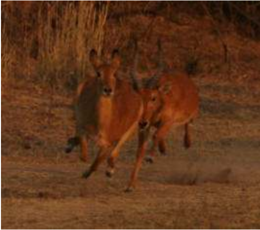
Male puku chasing a mate