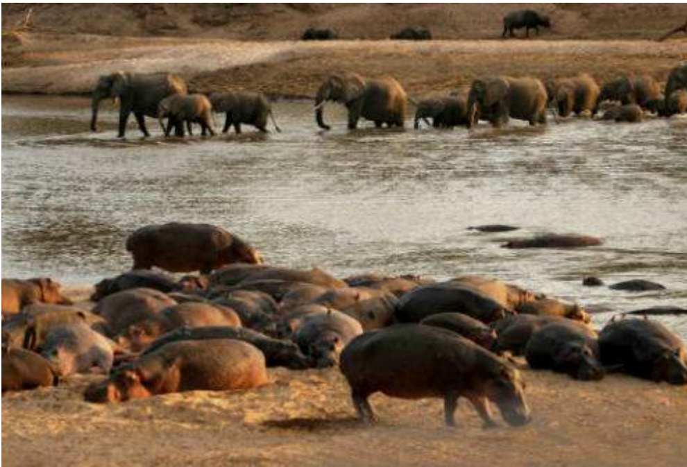
Elephants crossing at the mouth of the ebony grove