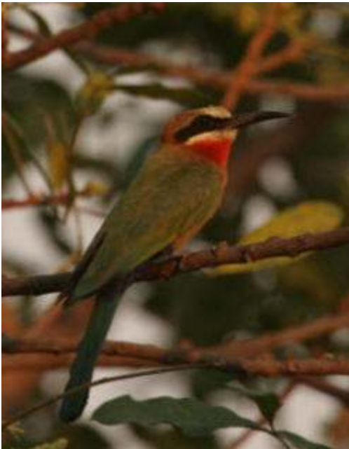
White Fronted Bee Eater