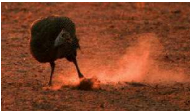
Guinea fowl at sunset